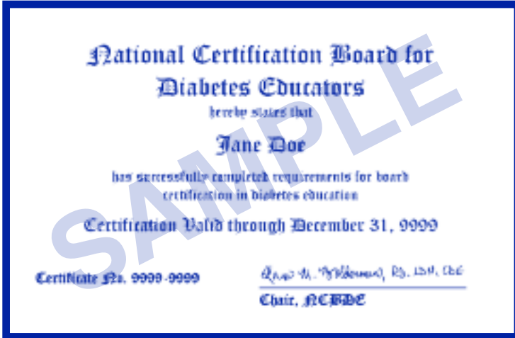
FRONT OF SAMPLE WALLET CARD